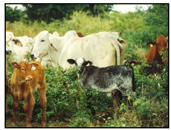
[ BB X Nelore]

Seeing a very higher killing-out percentage for the [Nelore X BB] crossbred, by comparison with the Brhford, it goes without saying that the BB joins in the increasing of the meat production in Brazil.