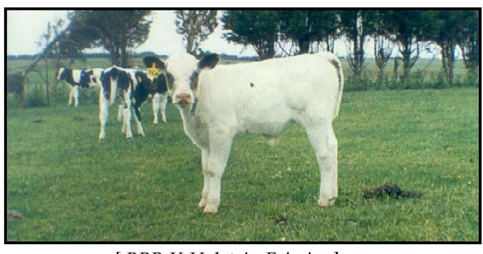
[ BBB X Holstein Friesian]