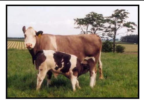
[BB X (crossbred Hereford)]