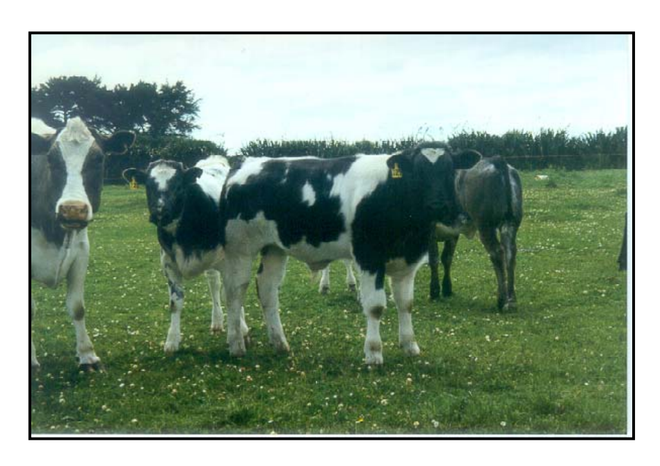
[ BBB X Holstein Friesian]