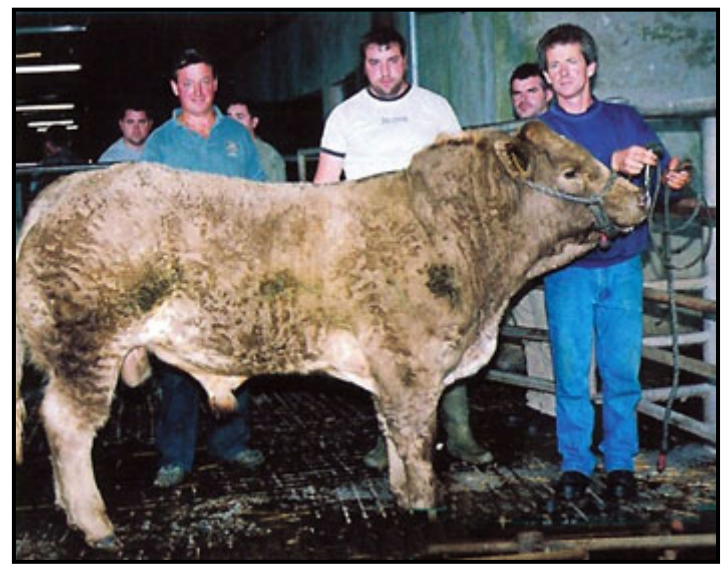
[BBB X Charolais]

The Belgian bulls, tested in pure, which present favorable indexes for the birth weight and the gestation length are, in accordance with our feeling, the best for the crossing in Ireland. Our Progeny-test is then an effective tool, able to ensure the promotion of our sires in crossing.