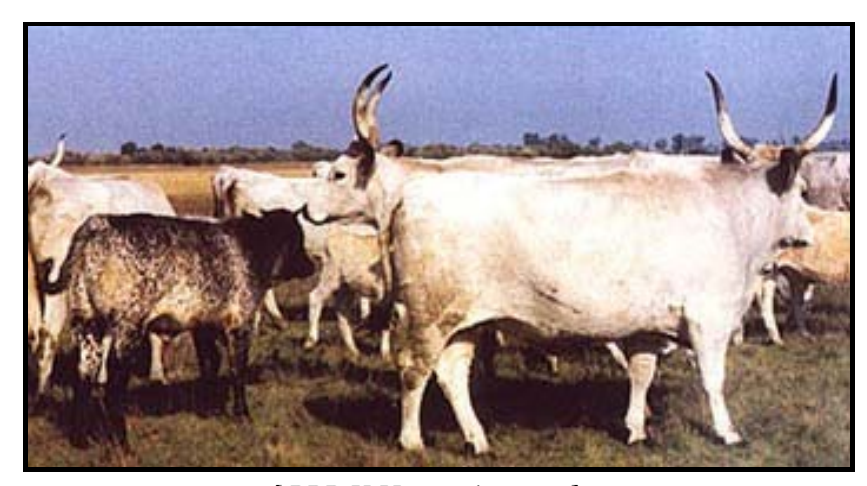
[BBB X Hungarian grey]

A third experimentation was related to the crossing with the Simmental. It appeared that, for a similar live weight, the carcass weight of the crossbred [BBB X Simmental] was by 23.4 kg (+6.6 %) more than the Simmental. The Killing out percentage was respectively for the crossbred and the purebred of 61.4 % and of 57.7%. Slaughter value of the crossbred was markedly and significantly higher than the purebred Simmental.