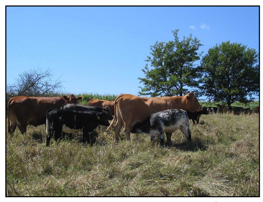
[BB X South Devon]

The Belgian Blue breed is an original type of bovine which has been created by the breeders of our areas in response to the requests of the market. These breed is the window of our agriculture and we are extremely proud of its amazing international destiny.